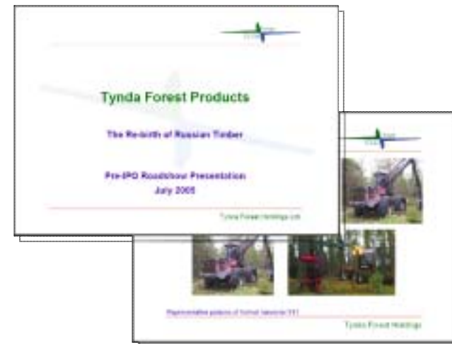
Roadshow Presentation, Photo Book